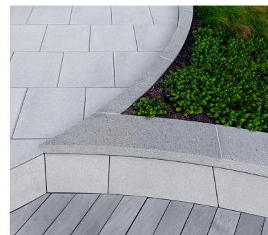
Top left to bottom right: Avigilon Office green roof overlooking the Mystic River / IPE hardwood deck, curvilinear pre-cast curbing and custom seat wall / Custom granite pavers border the main planting bed

Assembly Row is an award-winning mixed-use neighborhood at a former brownfield site on the Mystic River in Somerville, Massachusetts. Recover installed nine separate garden areas on three rooftop plazas overlooking a large waterfront park, creating a unique urban office escape. Perennial grasses, lilies, and dogwoods watered with an automated smart irrigation system create a serene aesthetic of grasses blowing in the wind.