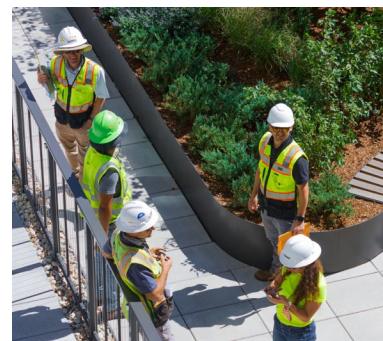
Top left to bottom right: Amoeba planters surrounded by pedestal pavers/ Installed sedum, sod lawn, and planters converging on checkboard decking / Members of Recover's project management team touring the finished space

Planter Fabrication Planterworx, Tournesol