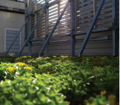
Top left to right Recover installed sedum mats on the ninth and eleventh floors of the historic Burnham Building in Downtown Crossing / Varieties of sedum flower yellow and pink in the summer, attracting honey bees, even in the heart of the city

Recover installed a half-acre, multi-level, sedum green roof that meets stringent wind uplift standards, provides stormwater management for the building, and creates beautiful green views for the adjacent offices and apartments.