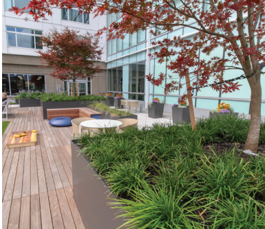
Top left to bottom right: 21-story view shows modern geometric pattern of new rooftop terrace / Outdoor kitchen with custom concrete countertops and steel pergola / Japanese Maples add color to the roof along with carefully selected pollinator-friendly plant